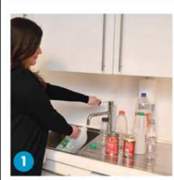
Rinse your cans, tins and plastic bottles.